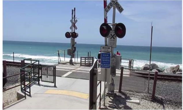
San Clemente Metrolink Crossing

The Metrolink Orange County Line is an excellent example of pedestrian rail crossing upgrades being made to achieve improved waterfront access.