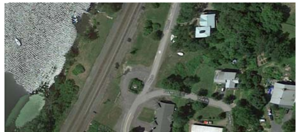
Germantown Site Location (MP 105)

Amtrak has indicated it is proposing these actions to improve public safety along the Empire Corridor South. The recommendations from Federal Rail Administration (FRA) state: "Eliminate all redundant or unnecessary crossings, together with any crossings that cannot be made safe due to crossing geometry or proximity of complex highway intersections" and "Install the most sophisticated traffic control/warning devices compatible with the location, (e.g. four quadrant gates) where train operating speeds are between 80 and 110 mph." 3 Amtrak's application would not "eliminate...redundant or unnecessary crossings," nor does the proposal include "the most sophisticated traffic control/warning devices." As currently proposed, Amtrak would construct the gates and fences without conducting a regional assessment of access needs or undertaking an analysis of their impacts on coastal resources and achievement of NYS CMP policies.