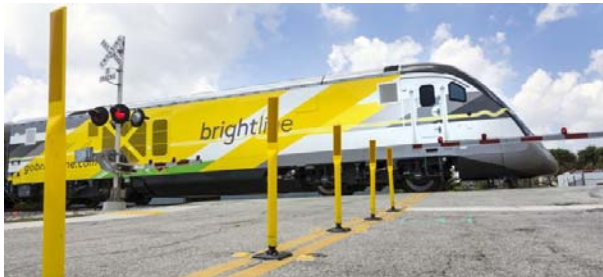
Florida Brightline

The Florida Brightline is an express intercity rail line operating at speeds up to 79 mph between Miami and West Palm Beach, with an intermediate stop at Fort Lauderdale. Developed by All Aboard Florida, a wholly owned subsidiary of Florida East Coast Industries, it is the nation's only privately owned and operated intercity passenger railroad. The Brightline runs along the state's densest population corridor, which contains more than 6 million residents and a regular influx of tourists.