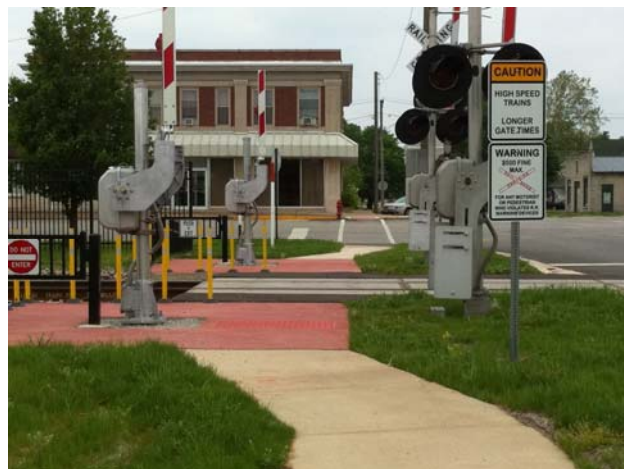
Illinois High Speed Rail crossing

The Illinois Department of Transportation (IDOT) Bureau of Railroads is leading the overall management for the project's development and implementation.