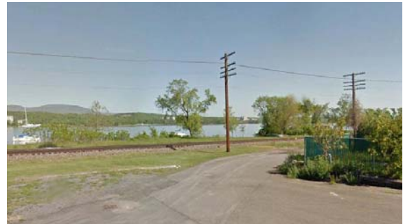
Germantown Site Location (MP 105)

McLaren also was asked to provide a preliminary overview of the proposed project's potential impact on coastal resources and achievement of New York's CMP policies. The findings are outlined in this white paper.