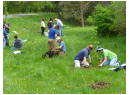
Volunteers planting at Trees for Tribs site.