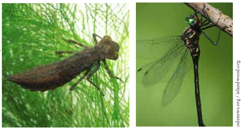
Dragonflies often start their lives as nypmhs in perennial streams.

Two waterfalls—one at either end of the preserve—give Falling Waters its name. Both are located on Hudson River tributaries that have no name. Both also are perennial streams, meaning they experience water flow year round except during conditions of extreme drought. Many forms of aquatic life, including insects, amphibians, small fish and mollusks, can survive in such streams even when the water level is very low. Mature hardwood trees line the streams' slopes, providing