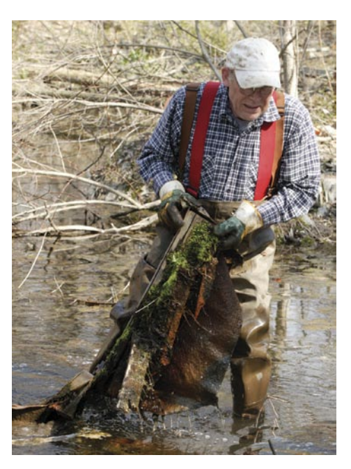
2004 Great River Sweep volunteers in the Wappingers Creek cleanup removed a toilet, washing machine, tires and truckfuls of debris. They were among 6,000 volunteers who pitched in to help.

Members of the Beacon Environmental Stabilization Team (BEST) worked on preparing new trails at Madam Brett Park in Beacon, Dutchess County.