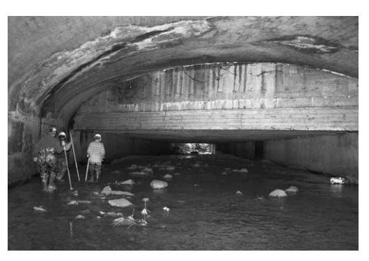
Our planning experts donned wading boots to investigate culverts that provide clues about the feasibility of "daylighting" the Saw Mill River. Sections of the important waterway were paved over more than a century ago.

Our efforts also paid big dividends this year in Yonkers . In the Westchester County city, we helped transform the riverfront from a pollution-scarred property into the new Habirshaw Park and a vibrant mix of business and residential space. We were so proud of the results, we decided Yonkers should be the site for our annual Spirit