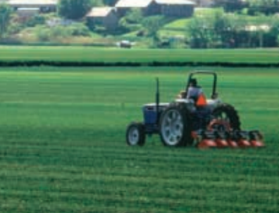
Scenic Hudson is a champion for protecting working farmland and the valley's cherished rural landscapes.

enabling people to hike the land and learn about wildlife. Also in Columbia County, we helped two more family farmers keep their land for agriculture. We signed land protection agreements on a 252-acre farm and, in partnership with the Nature Conservancy, a 452-acre farm.