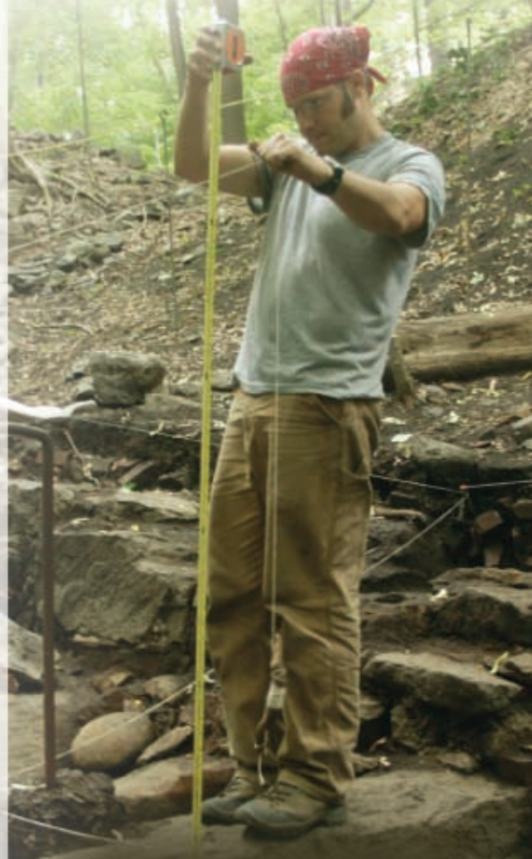
Renowned archaeologists explore the rich history of Scenic Hudson's West Point Foundry Preserve.

after three years of our negotiations with Dutchess County, New York State and the Town of Poughkeepsie – the local landmark Peach Hill property now belongs to the public. The town's highest point, its 162 acres of orchards and pastures would have been paved over by development.