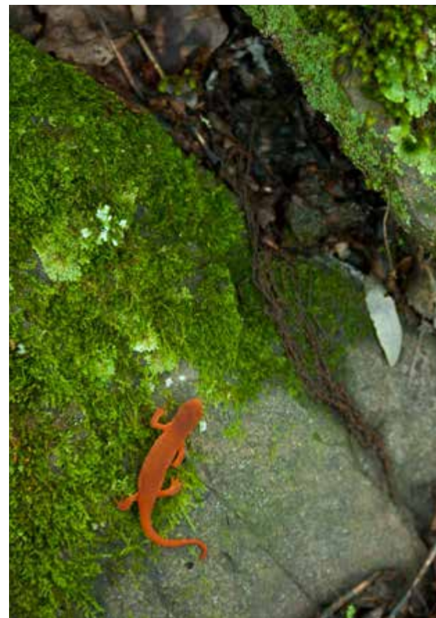
Robert Rodriguez, Jr. • www.robertrodriguezjr.com

Along the trail you'll also see lots of green-gray patches on rocks and tree trunks. That's lichen , the result of what's called a symbiotic—or mutually beneficial—relationship between a fungus and algae. Over time, lichen loosens the rock, creating soil in which mosses and ferns can grow. Because of its role in initiating forest succession, lichen is called a pioneer species . Eventually the mosses and ferns give way to annual and perennial herbs, shrubs and finally trees.