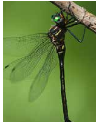
Dragonflies often start their lives as nymphs in perennial streams.