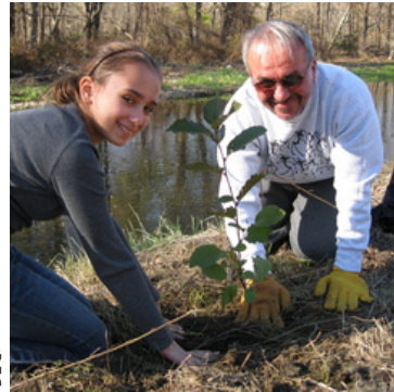
A healthy riparian buffer zone.